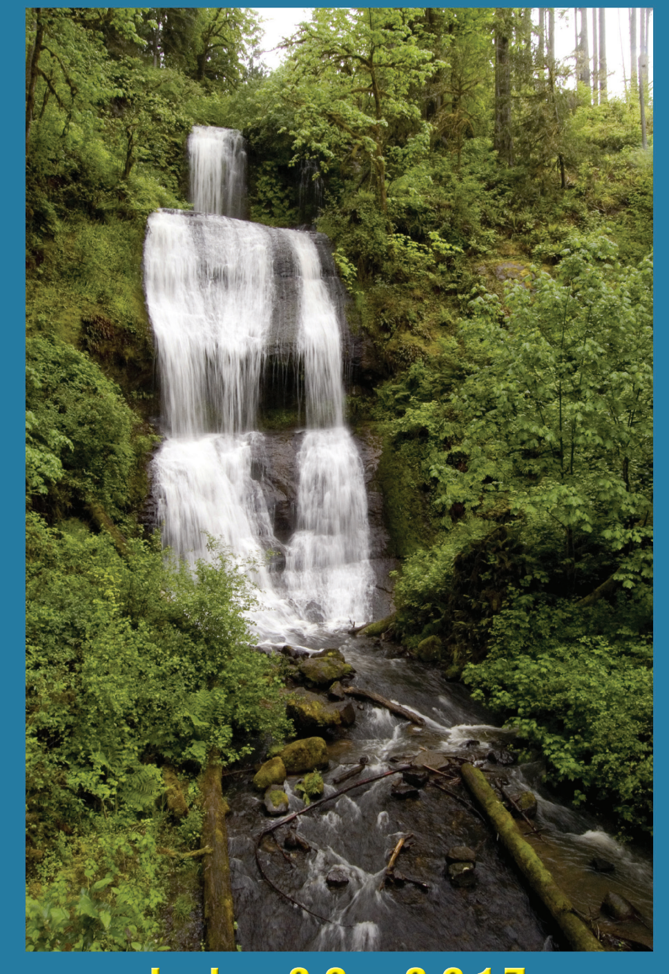
July 30, 2017

PO Box 873 • 1658 Long St, Sweet Home, OR 97386 • (541)367-6855 office@riversho.org • website: riversho.org